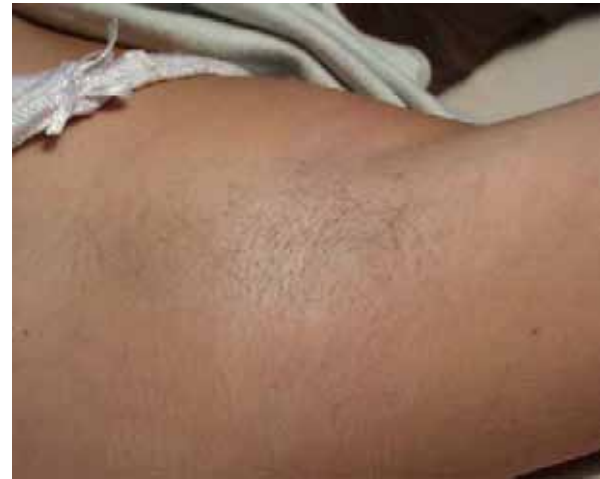
Result after 2 treatments