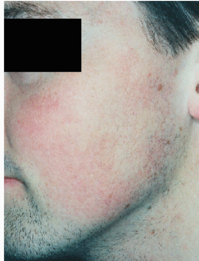
After 3 treatments