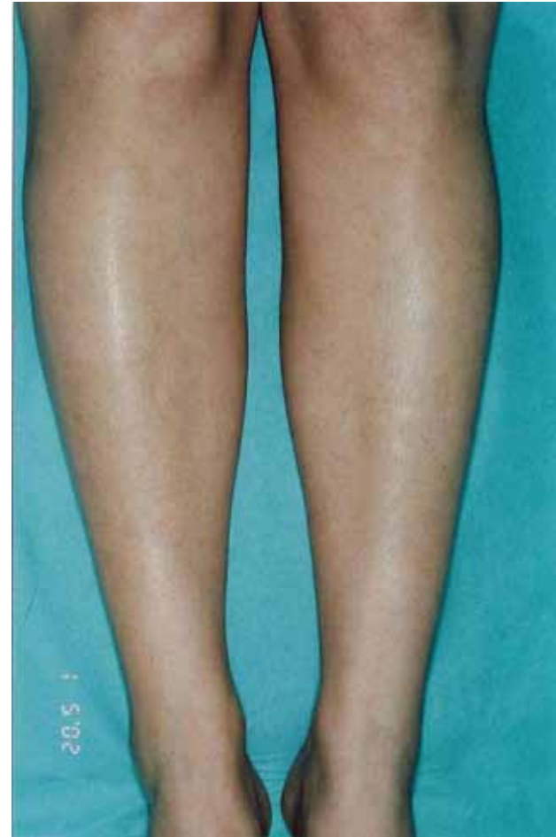
After several treatments