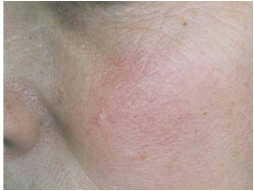
After 2 treatments