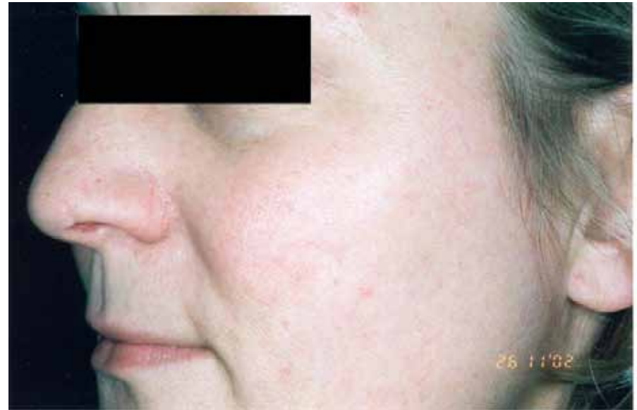
Before and After 1 Treatment