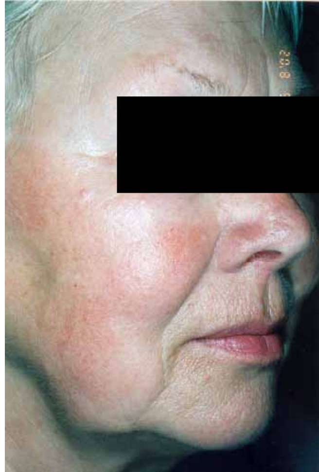
Before and After 1 Treatment