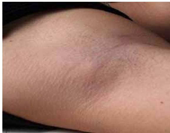
Result after 3 treatments