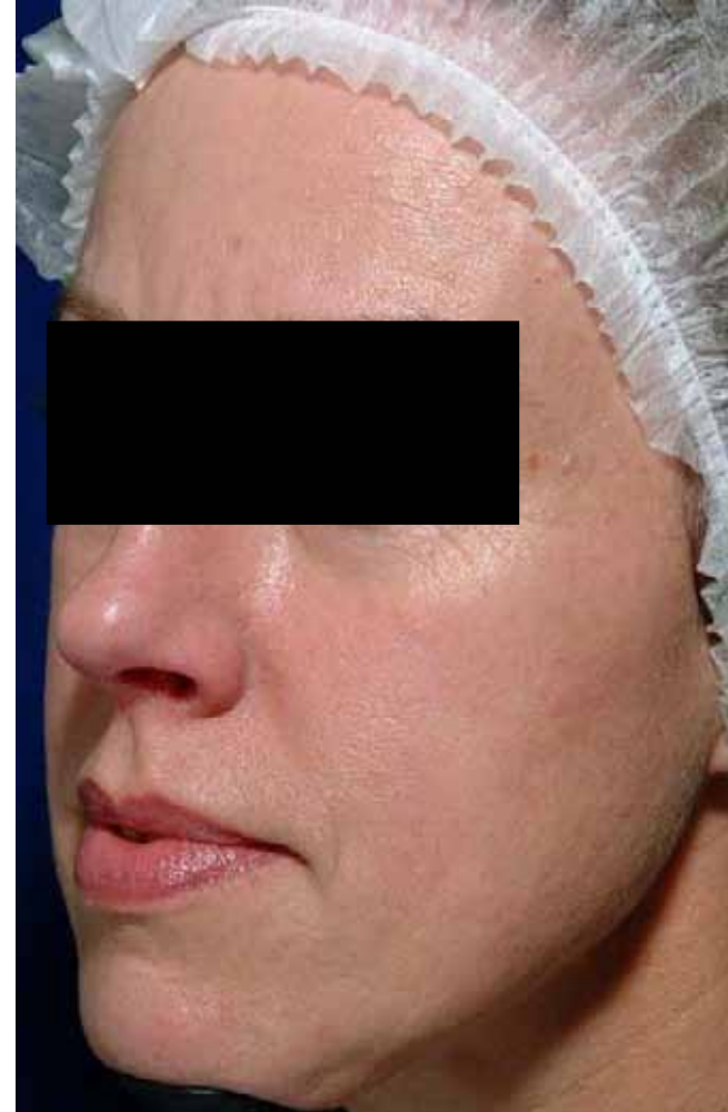
Before and After 1 Treatment