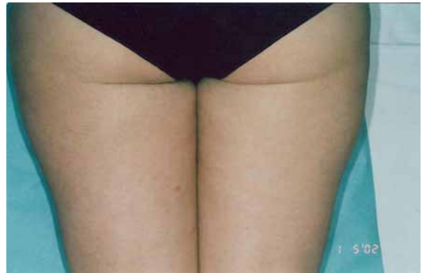
After several treatments